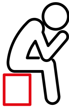
4. Fill a need