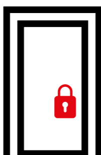
7. Maintain control