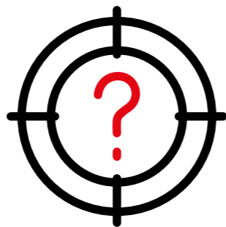
5. Prime the target