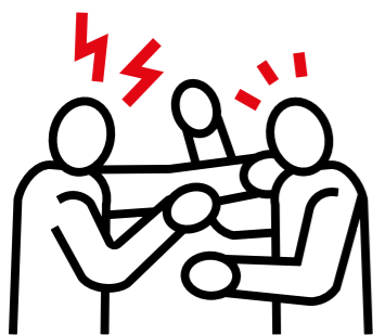
6. Instigate the home takeover