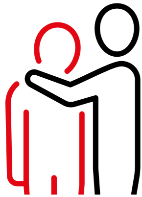
3. Build connection